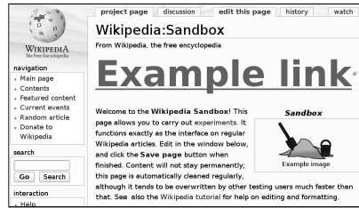
Fig. 2. Prominent link display in a wiki

complication. In this manner, one can approximate purchase quantity and value without having to fulfill transactions. Both case studies constructed/scraped landing sites that were pharmaceutical in nature (see Fig. 1).