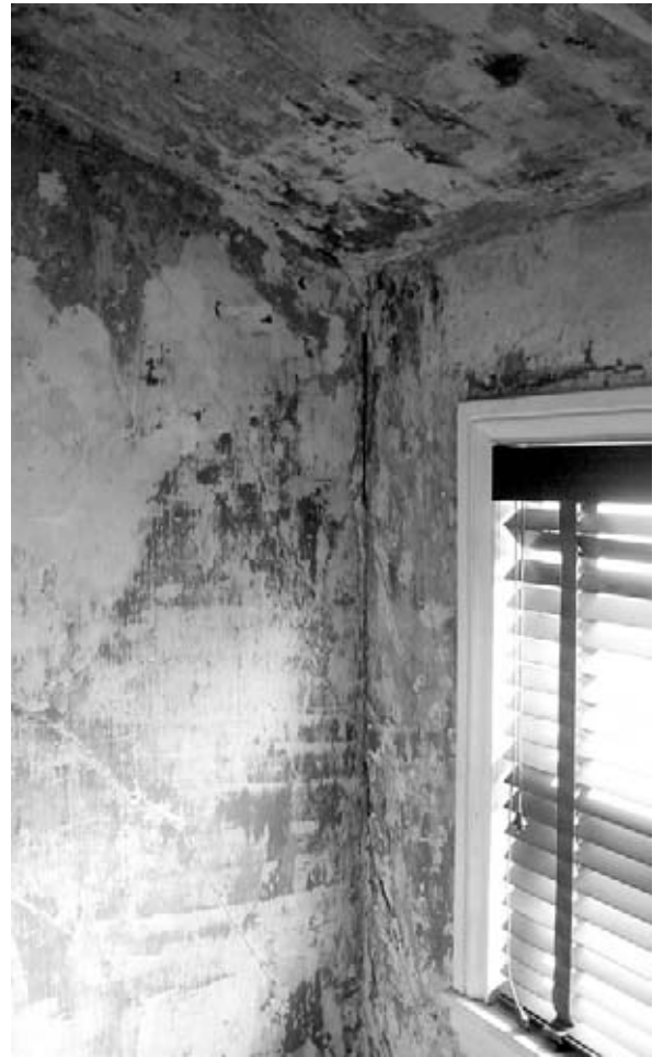
Figure 4 and 5: Interior Views of the Poe House, 2004.