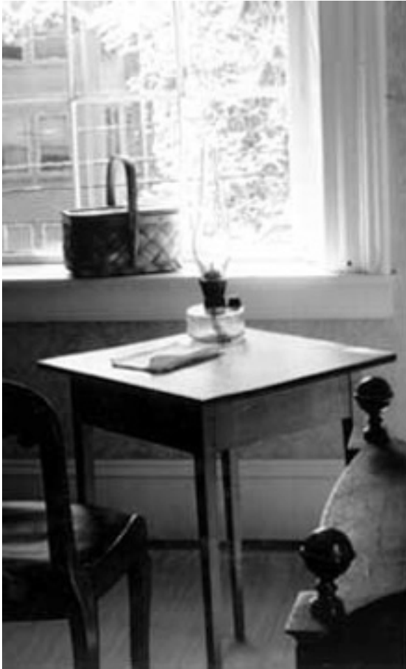
Figure 1: Emily Dickinson's desk in her bedroom in the Dickinson Homestead, n.d. Collection of the Emily Dickinson Museum.