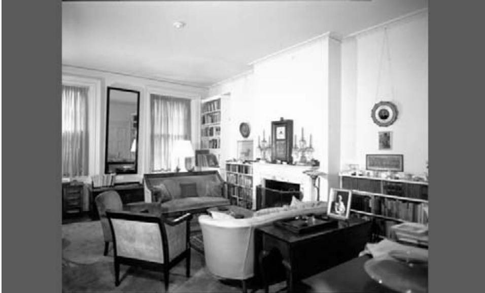
Figure 6: Installation of Marianne Moore Room's Greenwich Village Living Room in the Rosenbach Museum, n.d.