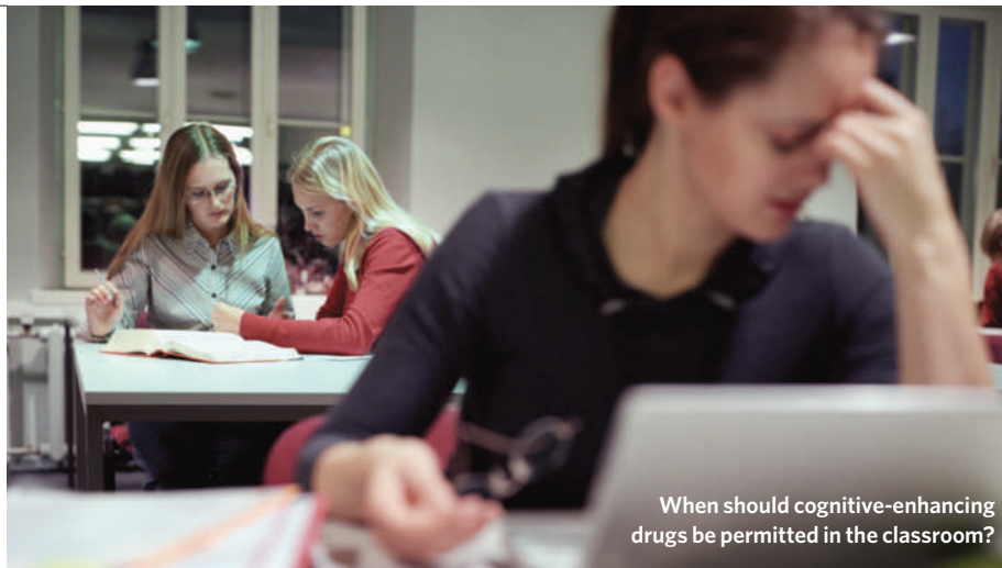
When should cognitive-enhancing drugs be permitted in the classroom?

a starting point for discussion of some of the key issues, such as how and when enhancements undermine the validity of a test result and the conditions under which enhancement should be disclosed by a test-taker.