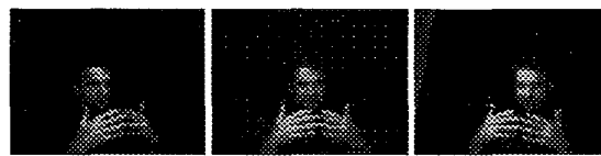
Fig. 2. Trinocular triple.

For tele-immersion we are further interested in the quality and density of depth points. Although the computa-