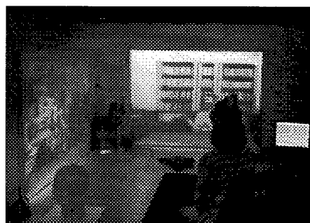
Fig. 1. A user in Chapel Hill wearing polarized glasses and an optical tracker communicates with two remote users from Philadelphia (left) and Armonk (right). The stereoscopically displayed remote 3D-scenes are composed from incoming streams of textured 3D data depicting the users, and off-line acquired static backgrounds.