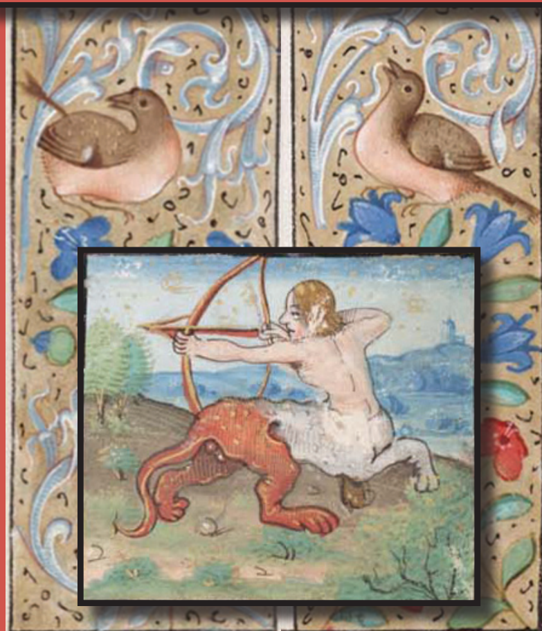
Sagittarius, from a Book of Hours, Lewis E 125, fol. 5r. The Free Library of Philadelphia

University of Pennsylvania, Rare Book & Manuscript Library, Van Pelt-Dietrich Library Center, 6th floor