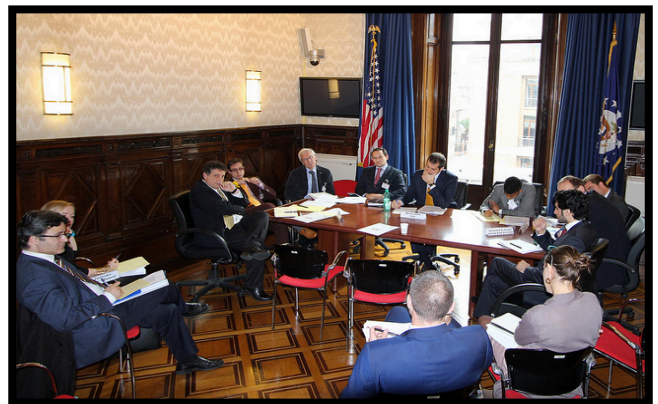
Participants discuss think tank solutions during a break-out session.