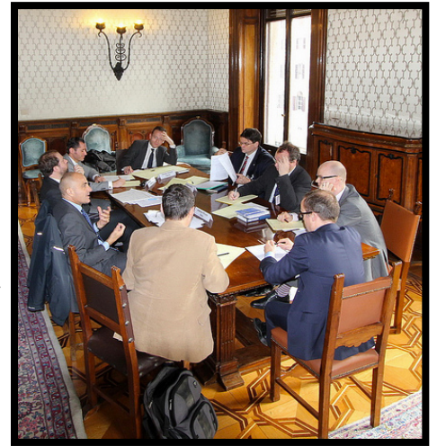
Participants share ideas in a breakout session.