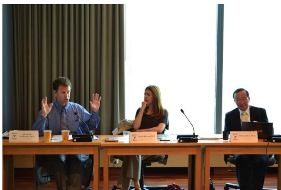
Michael O'Hanlon, senior fellow at the Brookings Institution, engages the participants during a panel session

The rapid expansion of transnational issues forces contemporary TTs to no longer view their research from a singular, national lens. They need to not only look at issues of national concern, but also those that impact the greater world, such as proliferation of weapons of mass destruction, implications of climate change and R2P. As one participant put it, "The days of armchair analysis are over. Scholars must be in country and on-the-ground in order to provide meaningful analysis." Others suggested that in order to be