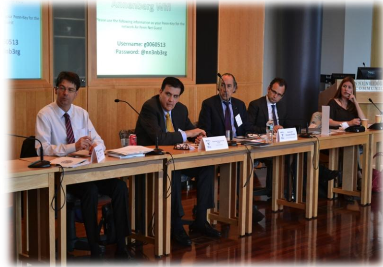
Participants take in the final roundtable discussion