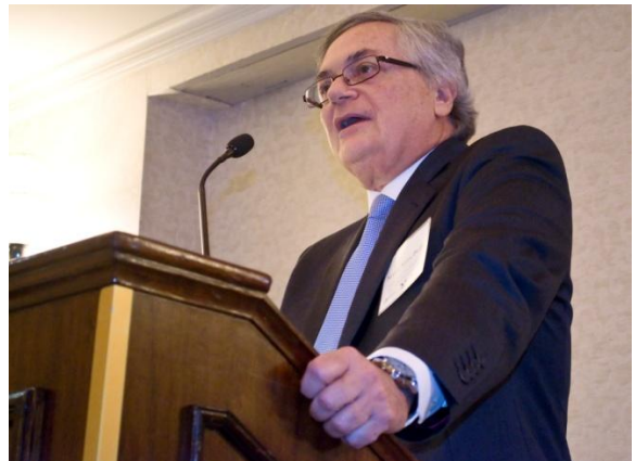
Moisés Naim, senior associate in the International Economics Program at the Carnegie Endowment for International Peace, delivers the keynote address

Governments don't have all the answers. Indeed, it was governments who failed to anticipate the economic collapse of 2008, and it is governments who today have failed to solve the Eurozone crisis. Where, then, will we find the answers? Think tanks aspire to fill this resulting void. It was in this spirit and context that over forty think tank (TT) directors, presidents, and senior fellows convened for the inaugural G20 Foreign Policy Think Tanks Summit in Philadelphia on the campus of the University of Pennsylvania. 1 The conference was groundbreaking in its scope and depth—TTs from every G20 country were invited; many of these countries were represented by multiple organizations. Across six sessions, four roundtable discussions, and two days, participants aimed to better understand the changing role of think tanks in a group of states with growing relevance in international affairs. Participants parlayed a variety of special, substantive foreign policy challenges such as Responsibility to Protect (R2P) and humanitarian and security crises in Africa and the Middle East. The conference also dealt with organizational matters ranging from the institutional intricacies of TTs around the globe to the role of TTs in the G20 and beyond.