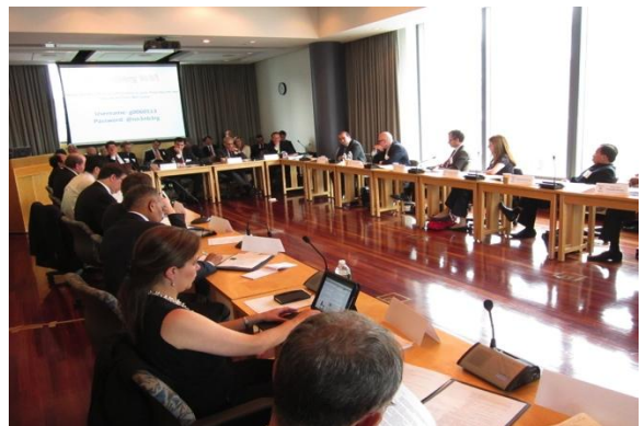
Participants share thoughts in a roundtable discussion

The 21 st century's 24/7 news cycle poses a unique problem for TTs. Not only is the rate of change increasing, but the heightened role of old and new media also increases our awareness of that change. Accordingly, donors and governments demand answers from TTs faster than ever. The concern is, however, that a shorter timeframe for research will be associated with a decline in the overall quality of the research. While TTs understand that their research depends upon funding from donors, it is imperative that they are able to communicate to their donors the importance of adequate degrees of freedom in setting research priorities and the time required to conduct in-depth, evidence based research. The goal is twofold: to have the necessary bridge funding so think tanks can conduct research on issues that require attention but have not come into focus for policymakers and donors; and to provide sufficient core funding to enable TTs to conduct research on emerging and enduring policy issues.