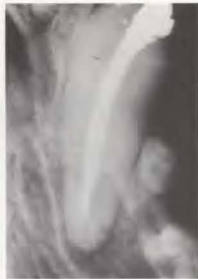
Upper canine tooth of a dog following root canal treatment.