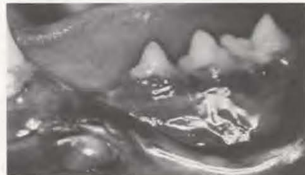
Lower jaw of a cat with severe gingival inflammation affecting the first premolar tooth.

epidemiology of periodontal disease in dogs, and other areas. Because some animal and human oral diseases share pathological similarities, this research may directly benefit human health. In addition the dental team is examining the efficacy of dentifrices (toothpaste) for animals and oral devices which aid in the natural cleaning of teeth, such as chew toys for dogs, made from a floss-like material.