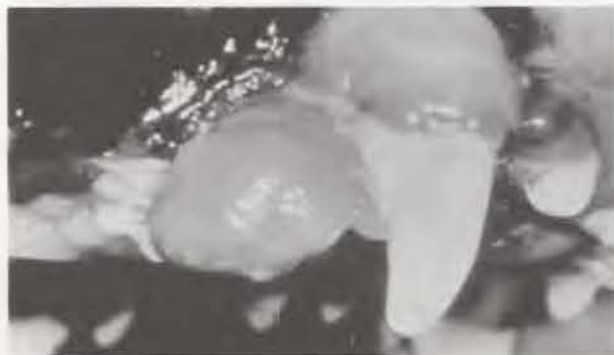
Severe gingival hyperplasia surrounding upper canine tooth of a dog.

ulcers, making it an extremely painful condition where the animal is reluctant to eat or groom itself. This can be life-threatening if left untreated.