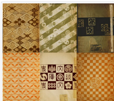
— Lining paper patterns from six of the ten pocket fiction series owned by Penn

Each volume of Tatsukawa bunko was bound in cloth in one of seven colors (red, blue, yellow, green, orange, black, or purple) with spines featuring the full title in gold leaf. Almost every book featured a frontispiece by ukiyoe artist Hasegawa Sadanobu III (1881-1963). These artistic merits surely appealed to their readership and lent an air of literary legitimacy to these cheaply produced books.