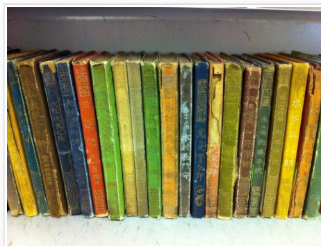
— Volumes of Penn's Japanese juvenile pocket fiction collection

So dig I did. Armed with a stack of original cards from the East Asia card catalog and data freshly harvested from the Libraries' Data Farm , I was able to get all of the books unearthed and shipped right to me. These diamonds-in-the-rough—or perhaps, roughly-hewn gemstones, given their panoply of colors and well-worn condition—proved to be much more interesting than I had imagined.