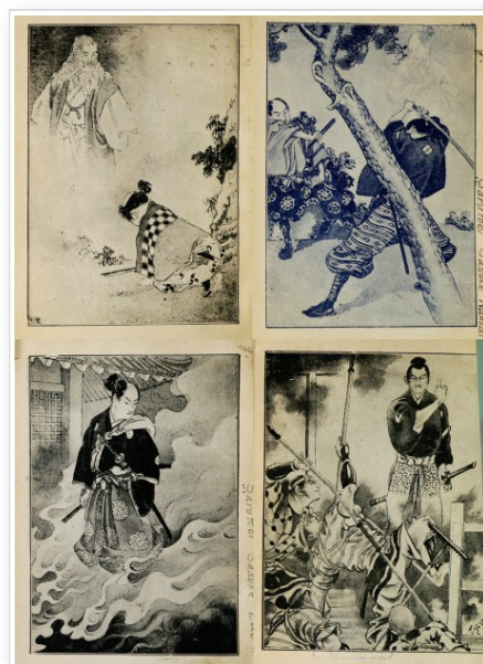
— Frontispieces from four Sarutobi titles published in Tatsukawa bunko. Art by Hasegawa Sadanobu III

With the death of Tamada in 1921, the Yamada family's literary efforts waned. Tatsukawa Bunmeidō continued to operate and reprint earlier titles of the series, up until the 1923 Great Kantō earthquake. Tatsukawa Bunmeidō continued to publish until early 1945, when an air raid on Osaka destroyed their offices, records, and all of the printing plates within.