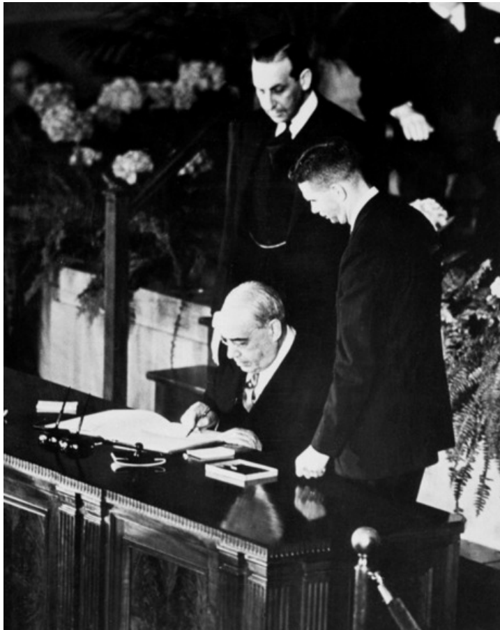
José Caeiro da Matta, Portuguese Minister of Foreign Affairs, signs the North Atlantic Treaty, April 4, 1949

This chapter looks at the formal establishment of Portugal and the United States as NATO allies to set the context for the diplomatic rift in 1962. In order to understand the