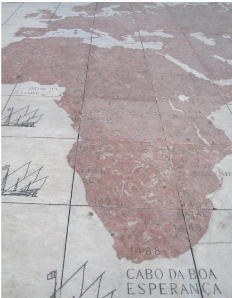
Map of Portuguese Empire with Dates of conquest in Belém, Lisbon

In the district of Belém in Lisbon, the architecture boasts of an imperial past. The Jerónimos Monastery and Tower of Belém proudly commemorate the Portuguese Empire. The ground in this area is adorned with a map of the world labeled with former Portuguese colonies and dates of conquest. Nearby, the Monument of the Discoveries