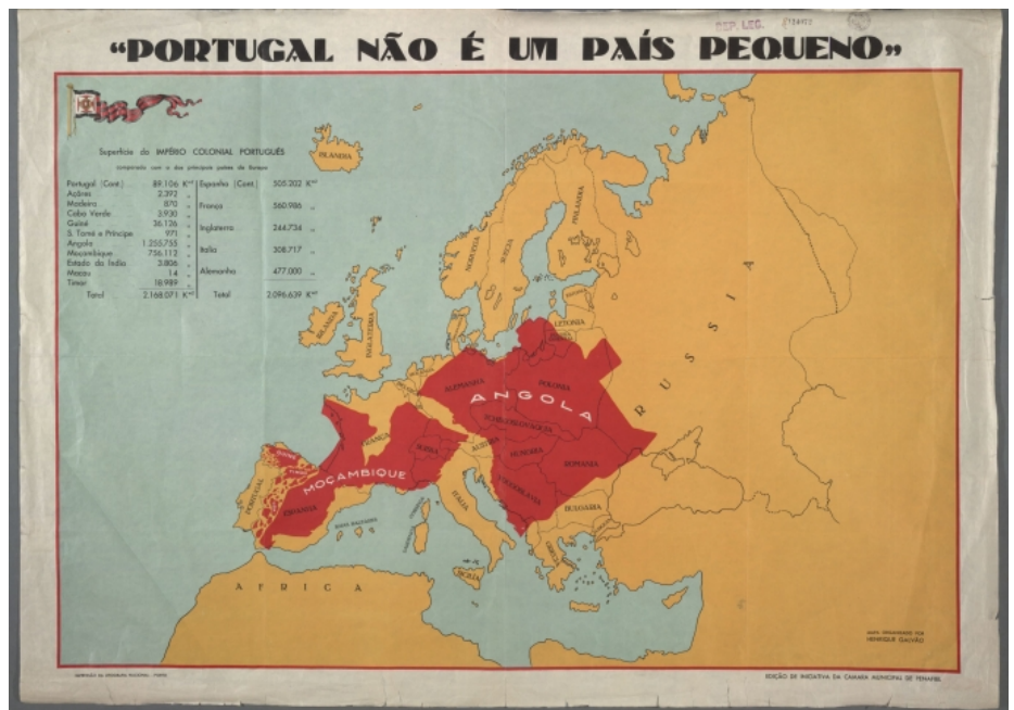
Portugal is Not A Small Country,” Map issued by the Secretariat of National Propaganda (Source: Pedro Miguel Sousa, 2008).

In 1932, Salazar was nominated to the position of the President of the Council of Ministers. 30 He then introduced a new Constitution for Portugal in 1933, formally promulgated on April 9, 1933. The 1933 Constitution marked the beginning of the Estado Novo , or New State, and Salazar’s rule as Prime Minister of the Portuguese Republic. Appended to the new Constitution was the 1930 Colonial Act. On June 13, 1933, only two months into his term as Prime Minister, Salazar convened Portugal’s first Imperial Conference in the chamber of the National Assembly. All colonial governors of the Portuguese territories were present. Salazar affirmed that the Portuguese conception of empire did not represent an expansionist tendency, but rather aimed at destroying the mind of the world the false conception that Portugal is a small country.