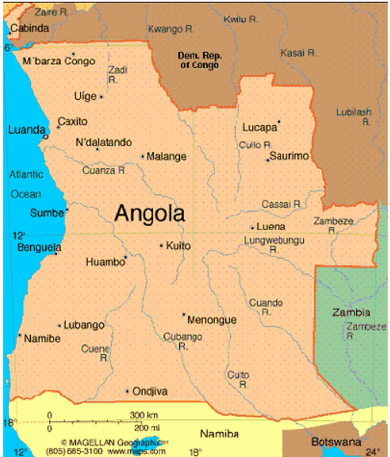
Figure 1. Map of Angola