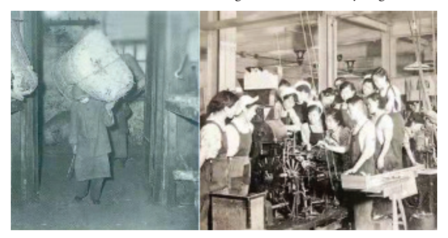
Pictures 2 + 3. Heavy work of transporting bags full of raw tobacco leaves (left). Female workers observing tobacco machinery (right)<sup>13</sup>

By 1911, machines replaced handicraft production in the tobacco factory. Although human workhands were still needed to feed tobacco into the machines, production quality and efficiency was greatly improved. Soon, the Lopato and Son Tobacco Company rose to a position of great economic influence in Manchuria.