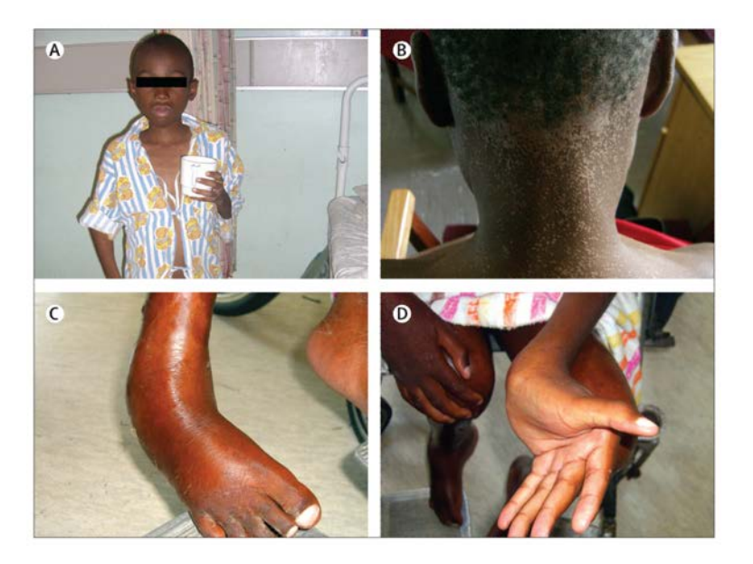
\label{lem:eq:continuous} \textbf{Figure 2. Clinical manifestations of HIV infection in adolescents infected by perinatal transmission } \\

(A) Severe stunting in a 14-year-old boy (height-for-age Z score -3.5). (B) Diffuse planar warts in a 13-year-old boy. (C, D) Deforming, non-infectious, seronegative arthritis in a 16-year-old boy. All patients and their guardians have provided their consent for pictures to be reproduced.