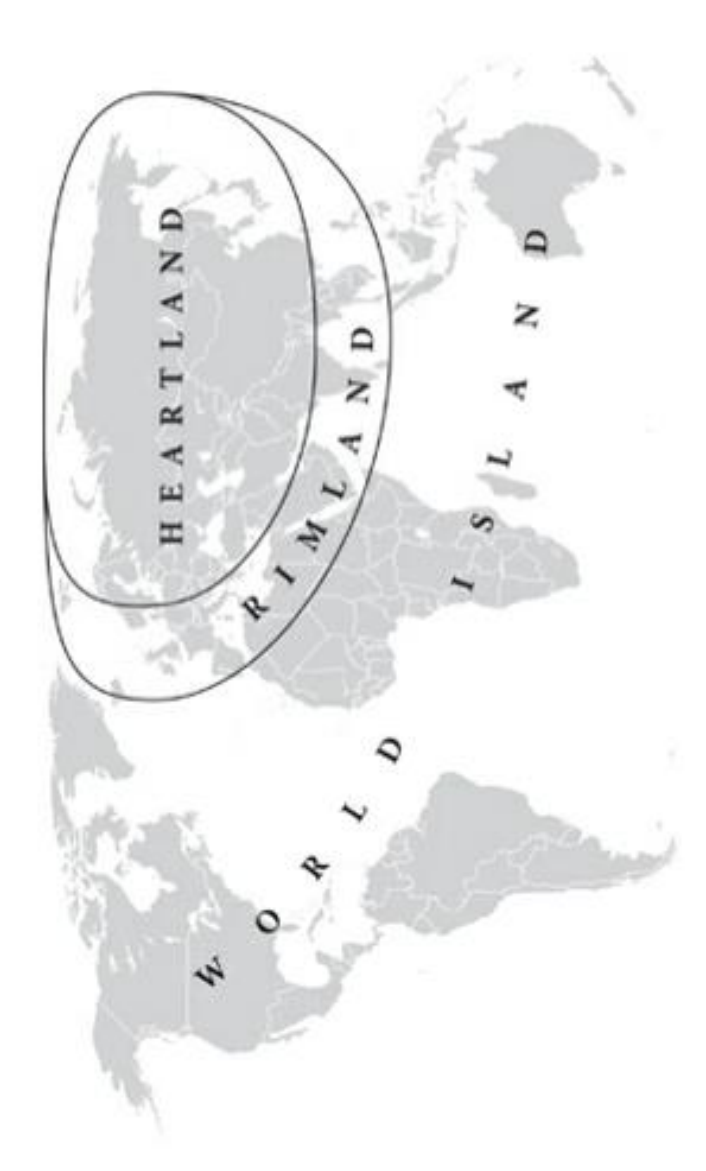
This map of the world, indicating areas of relative geopolitical importance, was first published by Halford MacKinder in "The Great Geopolitical Pivot of History" in 1904 and was reproduced by Aleksandr Dugin in The Foundations of Geopolitics in 1997.36